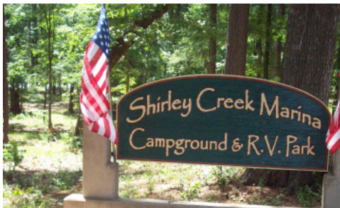
Beautiful Piney Woods!