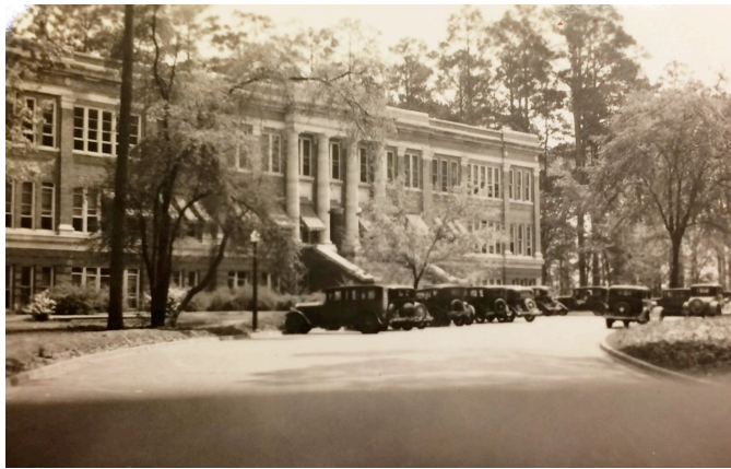
Stephen F. Austin Administration Building in 1923 photo.

From time to time, we would visit the Sterne-Hoya Museum and the Old Stone Fort. She had a lot of integrity and her actions all had reasons. The last time we took that trip, I was about 15 and she was beginning to show her years. She carefully maneuvered her car through downtown toward Stephen F. Austin State University. She turned into the big drive that led to the Administration Building; all while making small talk about my upcoming school year.