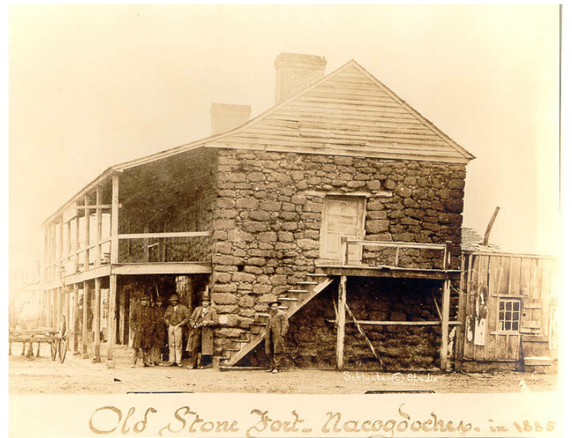
Old Stone Fort, circa 1885.