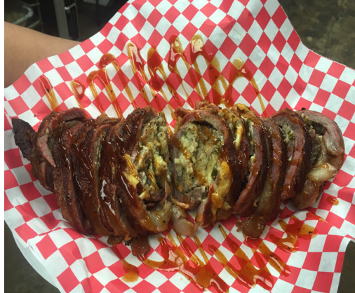
"Meat Lovers Link Special" is Louisiana Boudin stuffed with 3 kinds of cheese, jalapenos wrapped in a cowboy sirloin steak, wrapped in bacon and smoked on pit!

CC's Smokehouse also offers catering for small groups up to 1200 people. Hours are 11 a.m.-8:30 p.m. Monday through Saturday, closed on Sundays. For take-out orders or information, please phone 936.462.8880 or visit ccsmokehouse.net. "We don't want to see you just once, we want to see you for the rest of your life!"