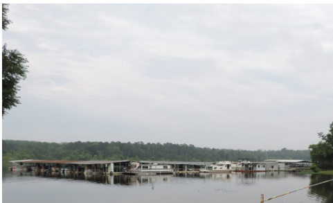
Covered Boat Slips!

23177 FM 226 - Etoile, TX 75944 - 936.854.2233 - Sam Rayburn Lake