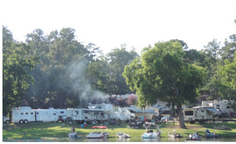
Large RV Park!