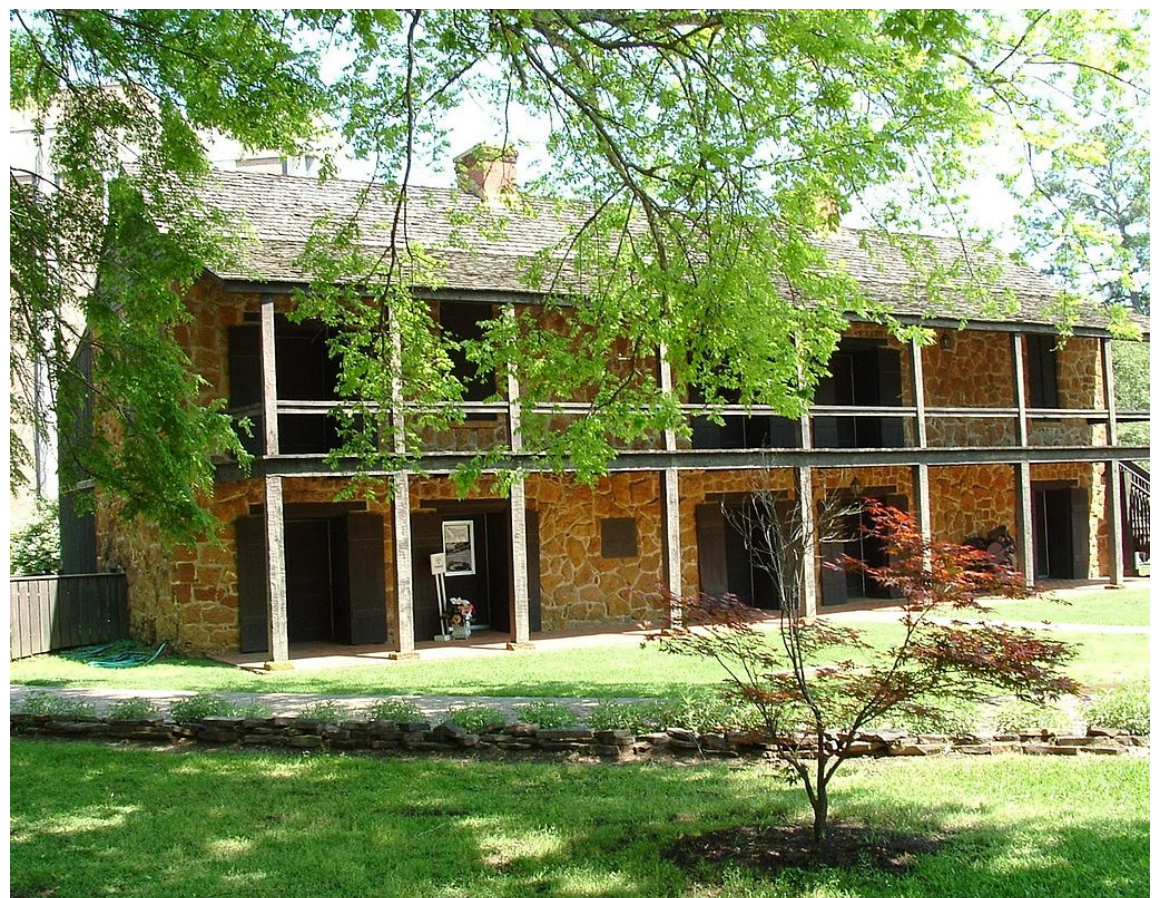
Replica of the Old Stone Fort, built for the 1936 Texas Centennial., sits on the campus of Stephen F. Austin State University. The building was designated a Recorded Texas Historic Landmark in 1962.

Decades later, the New Deal economic program of the Franklin D. Roosevelt administration provided funding for the construction of a replica of the old fort on the grounds of Stephen F. Austin State College. Dedication ceremonies were held October 16, 1936. The building became a museum, which is open to visitors and hosts historic exhibits.