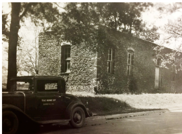
Old Stone Fort, built in 1779 and rebuilt in 1902, is shown in 1923 photo. Note the car in front bearing the markings of "Texas Highway Dept."

Good News Only Featured in Around The Town