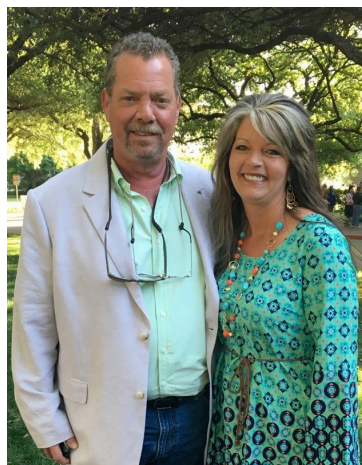
THRALL'S - Page 2

Located a short 3 miles from Nacogdoches, Thrall's is a thriving convenience store as well as a country style café. While there are several convenience stores in and around the Nacogdoches area, there aren't many that take as much pride in serving their customers as Thrall's. Whether it be ordering special requested items for their customers, greeting customers by name or helping them to their car with items, there's no doubt you will feel the family atmosphere when you leave.