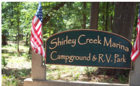
Beautiful Piney Woods!