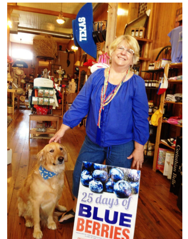
HEART OF TEXAS - Page 2

As one of the oldest gift shops in Nacogdoches, customers number into the thousands. Items have been purchased for; Willie Nelson, George W. Bush, and for use in the movie "Charlie Wilson's War." Rod Stewart's ex-wife and Nacogdoches county native, Alana Stewart, shops when she is in town. Customers have been from Australia, Sweden, Germany, Italy, France, Japan, China, Brazil, England, South Africa, Canada, Mexico, and almost every state in the Union. Children that first came in the store 22-years ago with their parents are now customers bringing in their own children.