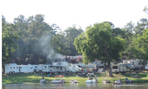
Large RV Park!